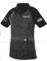
AM-LJ5 Sizes: XS - 3XL

Authorized ATOM/MHSAA officiating gear is now available at Hagin' By A Thread Weidman, MI Call 989-644-5738