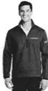
AM-LJ55J Sizes: XS - 4XL

ITEM AM-LJ5J $39.99 (XS-XL) • $49.99 (XXL) • $49.99 (3XL) • $49.99 (4XL)