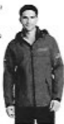
AM-MJ3 Sizes: XS - 4XL

ITEM AM-MJ3 $65.99 (XS-3L) • $67.00 (3XL) • $69.00 (4XL) • $71.00 (5XL)