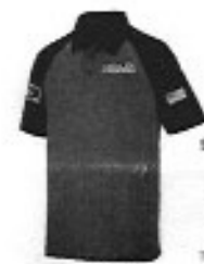
AM-LJ5P Sizes: XS - 4XL

ITEM AM-LJ5P $31.99 (XS-XL) • $33.99 (XXL) • $35.99 (3XL)