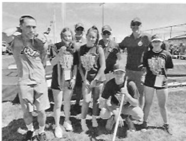
The D3 long jump crew and friends kept things rolling along