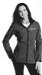
AM-LJ3 Sizes: XS - XXL

ITEM AM-LJ3 (Women) $49.99 (XS-XL) • $54.99 (XXL) • $94.99 (3XL) • $56.00 (4XL)