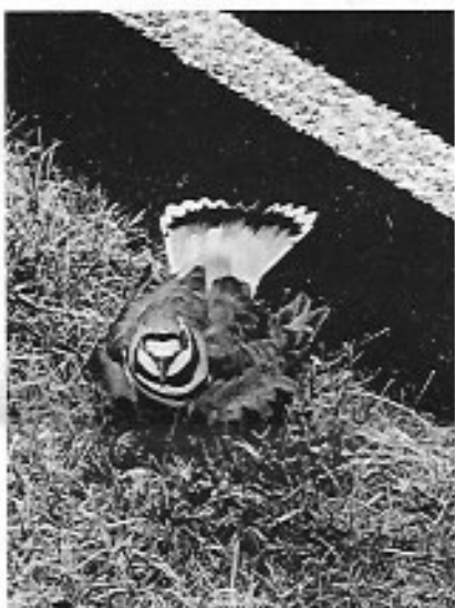
Momma Killdeer was displeased with all the uninvited guests at her D4 Pole Vault runway

We are all aware of what a difference a good announcer can make in the smooth running of a large meet. Our announcer did a great job of keeping the infield clear, and the fact that he was present on the infield rather than in the press box made it easy to ask for announcements as needed, such as requesting coaches to report for discussions with the referees.