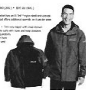
AM-LJ11 Sizes: XS - 4XL