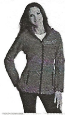
AM-LJ3 Sizes: XS - 4XL

Address: 2755 Woodpath Dr. NW • Grand Rapids, MI 49504