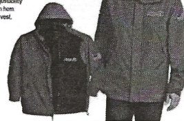
AM-UJ1 Sizes: XS - 4XL