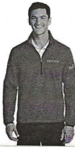
AM-USSJ Sizes: XS - 4XL

ITEM #AM - USSJ $39.00 (XS-XL) • $40.50 (2XL) • $43.00 (3XL) • $45.00 (4XL)